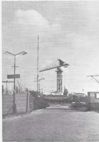
The Radio Caroline South ship (Mi Amigo) in dry dock at the Orange Wharf, Amsterdam, on March 17th, 1968.

After the departure of the other offshore stations on 14th August, 1967, Radio Caroline found herself alone and uncertain of her future. Insufficient revenue was pulled in from advertising to run the two ships, the Mi Amigo (Caroline South) and the Fredericia (Caroline North). Between 14th August, 1967, and the close-down on 3rd March, 1968, there were less than half a dozen paid advertisements. Most of the advertisements heard on the two Caroline ships were taped from television or from other radio stations, and of course there were always the old pre-August 14th cassettes to rely on.