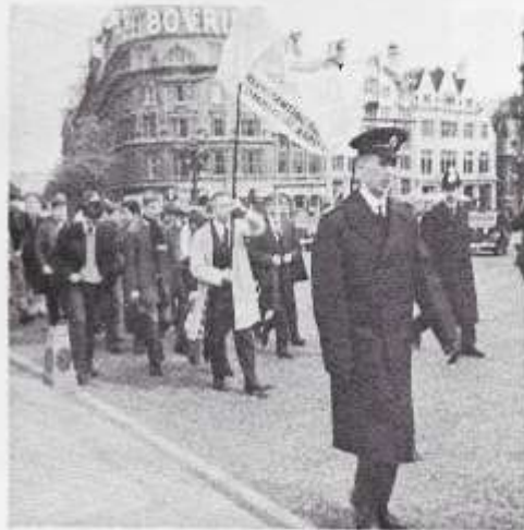
The 1967 rally was followed by a huge protest march to Fleet Street.