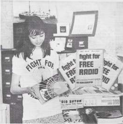
Sale of promotional material provides much of the finance which enables FRA to operate.