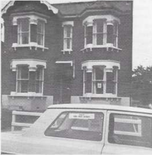
239 Eastwood Road, Raleigh, is a detached Victorian house with 7 main rooms, kitchen, bathroom and cloak-room.