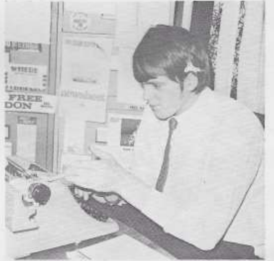
A volunteer helper tackles the correspondence.