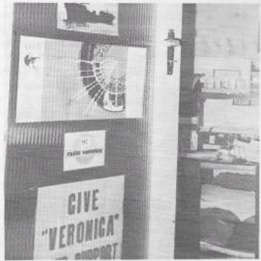
Let's go in!