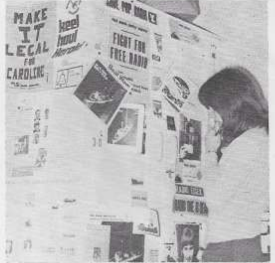
A historic corner!